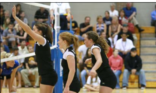
Volleyball Game Notes, Volume 2, Number 11 — October 31, 2006